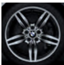
19" M Double-spoke style 351 M