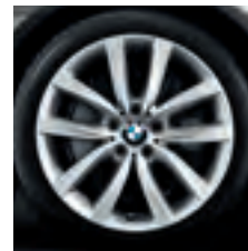
19" V-spoke style 331