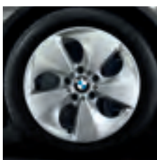
17" Streamline style 363