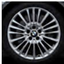
19" Multi-spoke style 455