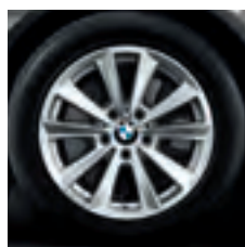
17" V-spoke style 236