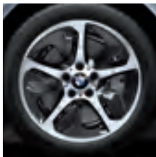
18" Streamline style 364