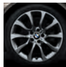
19" Turbine-spoke style 453