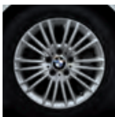
17" Multi-spoke style 456