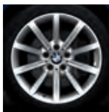
18" Star-spoke style 365