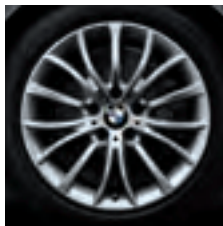
18" Multi-spoke style 454