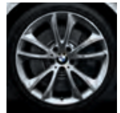
19" V-spoke style 366