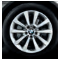
18" V-spoke style 328