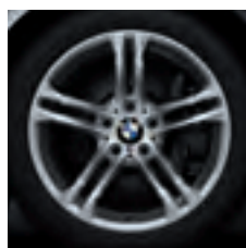
18" M Double-spoke style 613 M