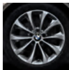
18" Turbine-spoke style 452