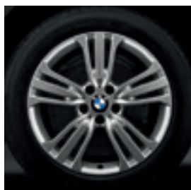
19" W-spoke style 447