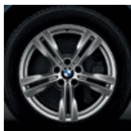
19" M Double-spoke style 467 M