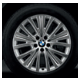
19" Multi-spoke style 448