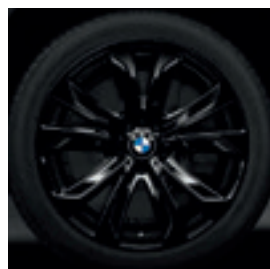
20" Star-spoke style 491 - Black