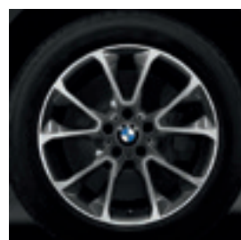
19" Star-spoke style 449