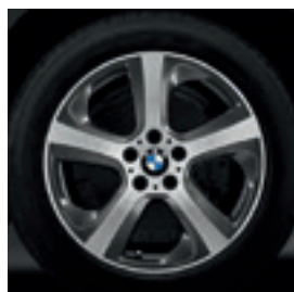
19" Streamline style 490