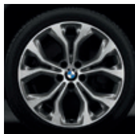
20" Y-spoke style 451