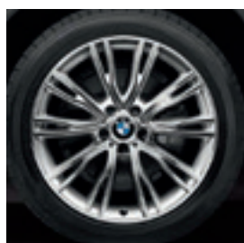
20" BMW Individual V-spoke style 551I