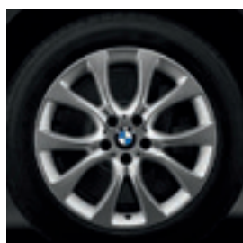
19" V-spoke style 450