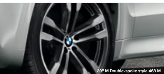
20" M Double-spoke style 468 M