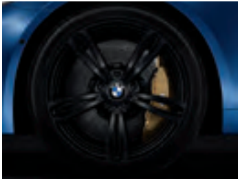
20" M Double-spoke style 343 M, Black