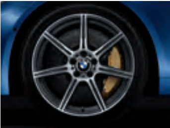
20" M Double-spoke style 601 M